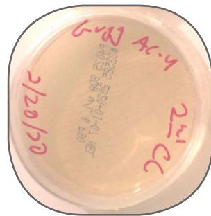
Contact Plates with UVC System (After 3 to 4 Weeks)

DVM Industries. 1965 Steinway Street, Astoria NY 11105. 212-739-7846. Minority, Veteran, Women Owned Company